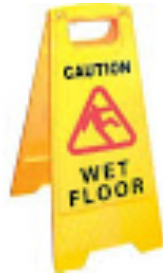
Wet Floor Sign