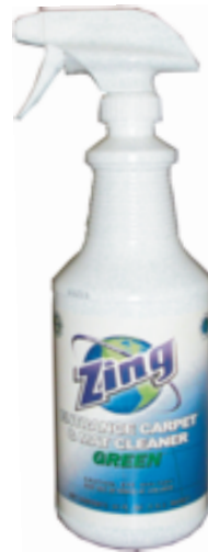
Entrance Carpet & Mat Cleaner