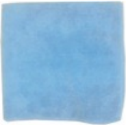
Blue Microfiber Cloth

Do Not rub spots & stains with a cloth, blot only.