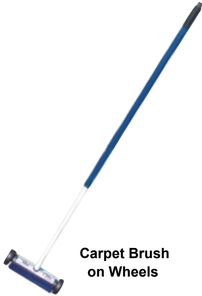
Carpet Brush on Wheels